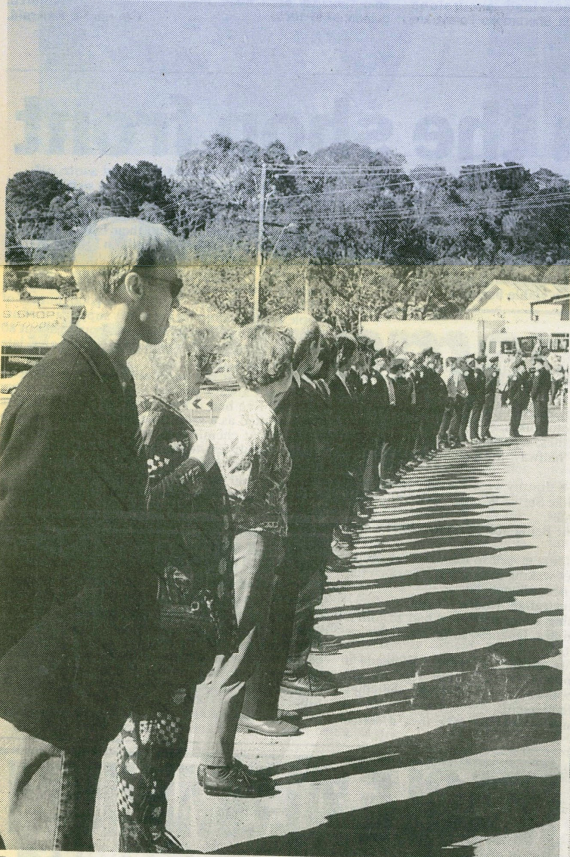
Farewell to a tireless worker: CFA officials turned out in droves to pay their respects.