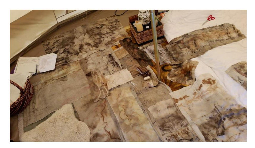
It is in the making of something that is in-between the visible and the invisible that a person becomes. And in making something an individual contributes to what is in the world and therefore becomes connected.

We will also consider how the public who engages with our work may respond intersubjectively and continue the co-creation during the exhibition, allowing for a flow, a dialogue between self and other.