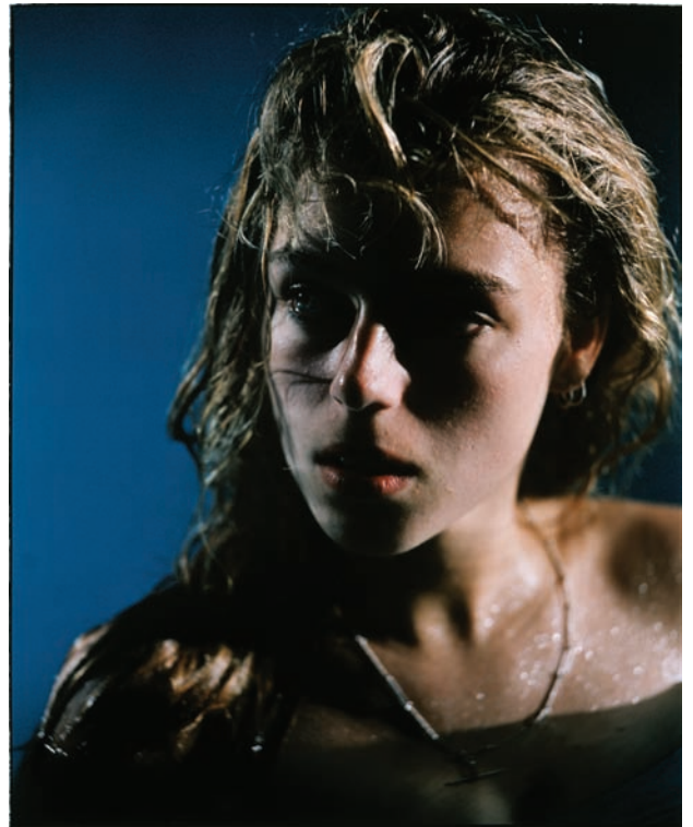
Bill HENSON Untitled 1985–86 from a series of 154 chromogenic print Monash Gallery of Art, City of Monash Collection: 1988.22

Passionate discussions in Australia, especially the media, about Henson's work and what it says about the nature of art are ongoing. This exhibition at Burrinja offers a rare opportunity for local audiences to experience the diversity and complex materiality of Henson's work first hand, unhindered by the distortions of reproduction.